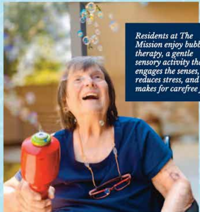
Residents at The Mission enjoy bubble therapy, a gentle sensory activity that engages the senses, reduces stress, and makes for carefree fun.